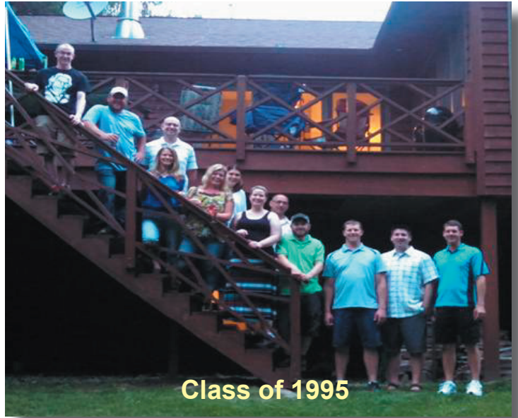
Class of 1995