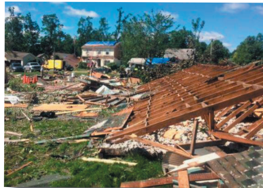
The remnants of the pole barn on Father Flohe Field after the tornado.

I entitled this article "Portland Strong" which comes