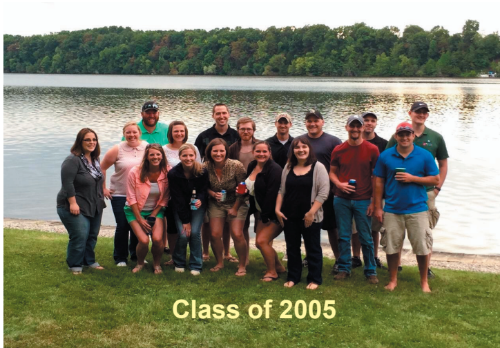
Class of 2005