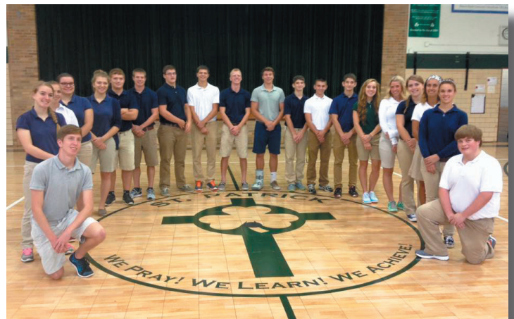
The Class of 2016 pose on the new gym floor.

A massive fundraising effort was undertaken at the spring Shamrock Auction, and approximately $60,000 was raised in a very short time. Originally, it was thought that the total cost would be in the $60,000 range; however, because of the amount of wear to the asbestos tiles, a professional abatement company was hired, at an additional expense, to remove the old floor. Currently the floor/bleacher fund is about $13,000 away from what we need to pay in full for the project.