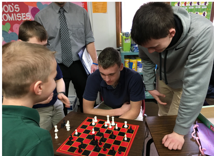
Big Rocks and Little Rocks compete in a game of chess while others look on.

The younger students understand they are valued because they have an older student looking out for them, who is there to help them with special projects or just to say hello. They take pride in watching their own Big Rocks participate in extracurricular activities throughout the school year. Little Rocks usually can't wait to grow up and be old enough to have their own Little Rock.