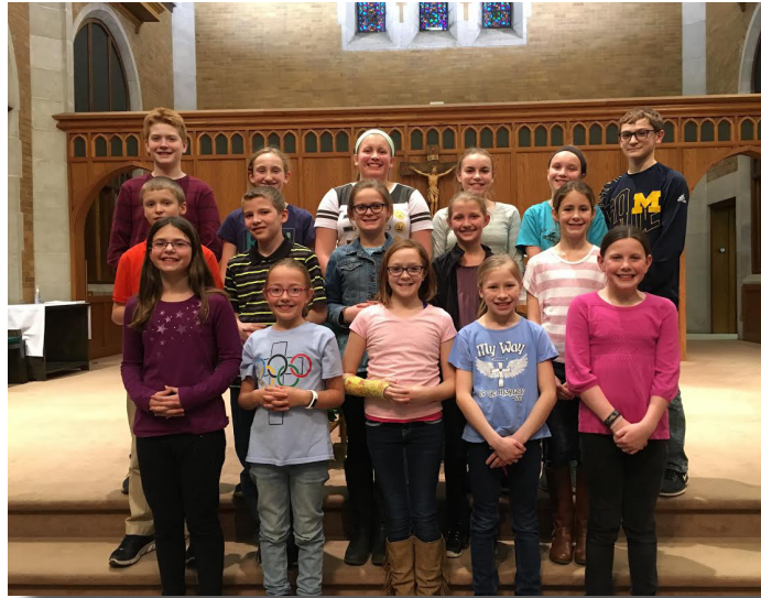
Sixteen new altar servers completed their training in February and began serving Mass on March 4. We now have 96 active altar servers, one more than last year at this time. Our parish should rejoice in this outpouring of service at God's altar.

We're doing a lot of things right here at St. Patrick. With prayer and example abounding in our parish, the Lord can and will do marvelous things!