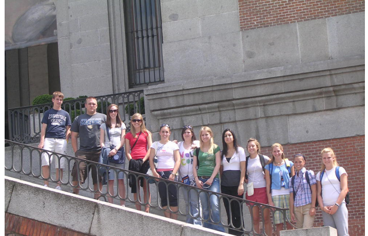
The twelve traveling students pose on the steps of the Prado Art Museum in Madrid, Spain.