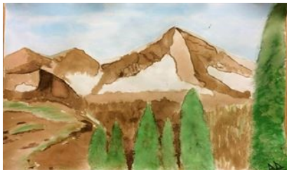
Watercolor Landscape by Amy Shaw

So much has been going on the past couple of months! The students wrapped up their watercolor paintings of landscapes. The students have been using a new medium, liquid watercolors. These watercolors are different from those used in the past for paintings in art class. The paints are already in a liquid state but are highly concentrated. The students add water to the paints to lighten the colors to create the tints and shades needed to create their final pieces.