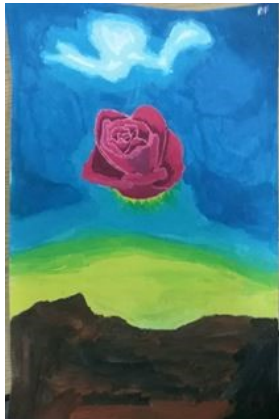
The Meditative Rose by Devon FoxElster

As they completed their watercolor paintings they have been working on a cross-curricular assign-