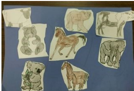
Neutral Color Page by Ethan Chamberlain