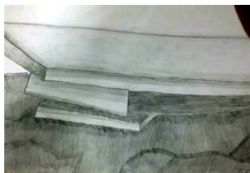
Still Life by Brice Cook

The students have been in full swing working hard on some detailed works of art. They completed their still life drawings which took much patience and a keen eye for detail. They turned out amazing!