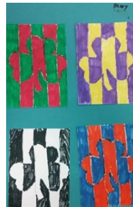
Pop Art Shamrocks by Mary Stump

2nd The second graders have been learning about textures. They have practiced drawing implied textures and will be using those in their haunted houses. They are still working on wrapping this lesson up. Their houses will also have a fun surprise that will pop out from their drawings!