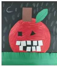
Jack-o-Lantern by Sarah Kwiecinski DK

The students just finished up their Halloween jack-o-lanterns. They painted the pumpkin shape and then collaged on all of their adorable features! They are working on learning about more art elements like patterns, textures, and colors!