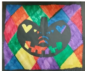
Stained Glass Pumpkin by Kiley Hengesbach 1st

K The students just created Halloween pumpkins with various emotions. The students will be creating Thanksgiving day lessons soon of a turkey!