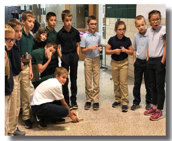
Elementary students test their inventions from their STEAM class.