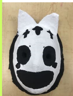
Mask by Connor Cross

sculptures. They worked on creating two interacting creations that will reflect some sort of emotional response. They are catalogu-