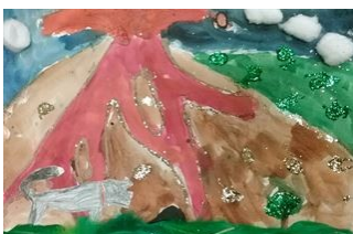
Creature Creation by Theodore Brown

The third graders have not been in art too much over the past couple months because of snow days and days off!! They were able to finish their creatures and had fun adding texture to their final pieces. They learned about circular weaving and will be completing those soon. Hopefully after Spring break they will be creating Chia pets out of clay!