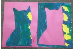
Van Gogh's Cat by Elizabeth Wight

Over the past couple months the students have learned about texture, drawing themselves, collages, and creating functional art. They have been working hard and their art books will be complete for the art show in the spring! Looking forward to more exciting projects.