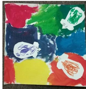
Mouse Paint by Lucian VanderMey

The first graders have been creating a series of different projects. They have created several holiday projects. They designed special crosses for St. Patrick's day, they created Easter baskets with unique Easter eggs in them, and they finished up their patterned snowmen with colorful hats and hands in the air! They also heard the story Mouse Paint and painted mice using cotton balls!!