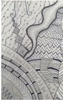
Monochromatic Zentangle by Olivia Pung

They then moved onto creating a drawing called a Zentangle. Zentangles are sophisticated doodles or designs. They filled a piece of colored construction paper with their designs and then used black markers, colored pencils, and a white color pencil to create value,