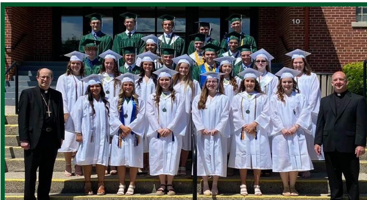
Congratulations to the St. Patrick School Class of 2020. They gathered on the gym steps for a photo following their outdoor graduation ceremony.

The St. Patrick High School Chapter of the National Honor Society will be sponsoring three American Red Cross Blood Drives during the 2020-2021 school year. The blood drives will take place on November 24th, January 19th, and March 23rd in the St. Patrick Parish Hall. Blood drives begin at 10:00 a.m. and end at 4:00 p.m. Please contact any St. Patrick School National Honor Society member to sign-up or email randyhodge@portlandstpats.org .