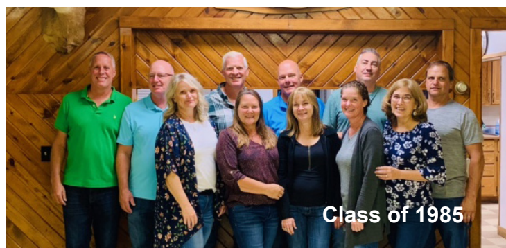
Class of 1985

The Class of 1981 held their 40-year class reunion on Saturday, September 11, 2021, with dinner and drinks on the outdoor deck at Fabiano's River House in Portland.