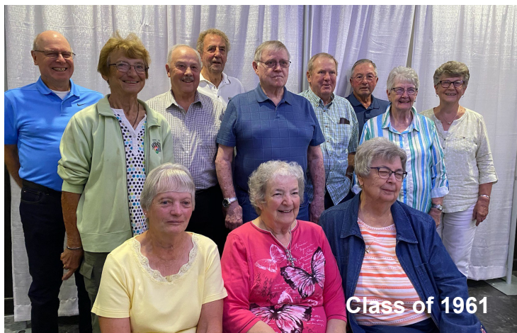
Class of 1961

The Class of 1961 met at the Wagon Wheel on September 10, 2021, to celebrate their 60-year reunion. Twelve members of the class, along with some spouses, enjoyed the get together.