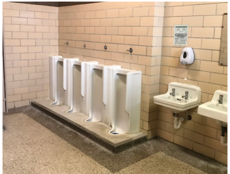
The bathrooms on the first and second floors of the school, which were built in 1952, are set to receive a total replacement this year. The bathrooms contain the original fixtures which are 70 years old. A bathroom for the faculty will also be added.

With your support, St. Patrick School will continue to provide a quality Catholic education for generations of new students.