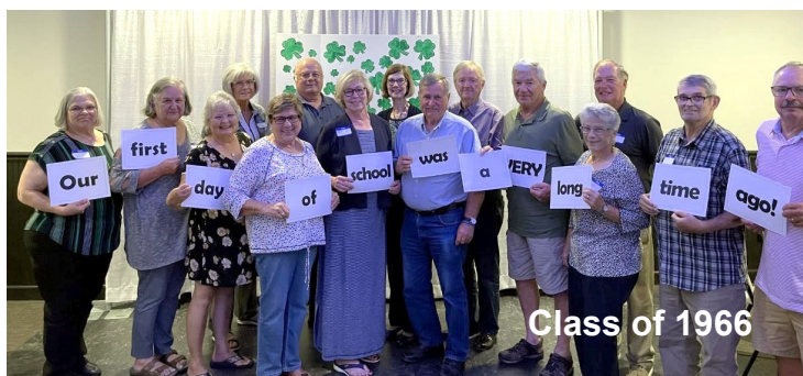
Class of 1966

The Class of 1961 met at the Wagon Wheel on September 10, 2021, to celebrate their 60-year reunion. Twelve members of the class, along with some spouses, enjoyed the get together.