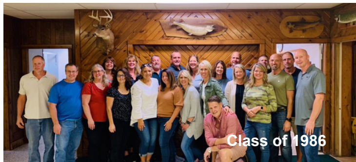
Class of 1986

The Classes of 1985 and 1986 held a joint reunion at the Portland Conservation Club on October 1, 2021. All agreed that it was a wonderful time, reminiscing and getting reacquainted with everyone in attendance. Classmates played corn hole and participated in a euchre tournament. The pandemic definitely had an effect on attendance, they hope that more will be able to attend the next reunion!