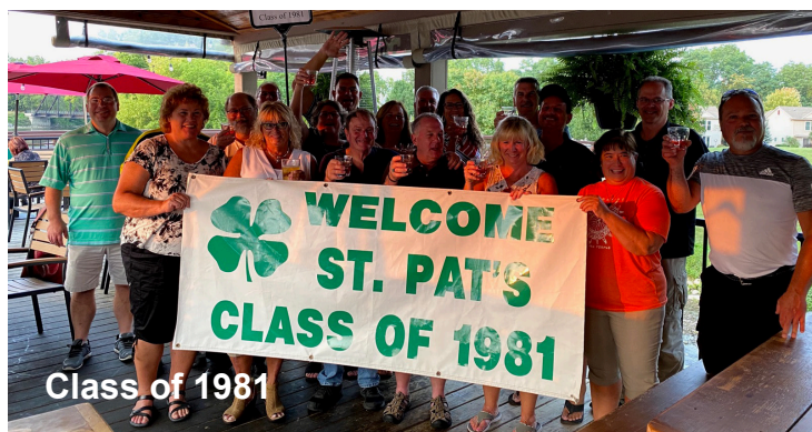
Class of 1981

The Class of 1981 held their 40-year class reunion on Saturday, September 11, 2021, with dinner and drinks on the outdoor deck at Fabiano's River House in Portland.