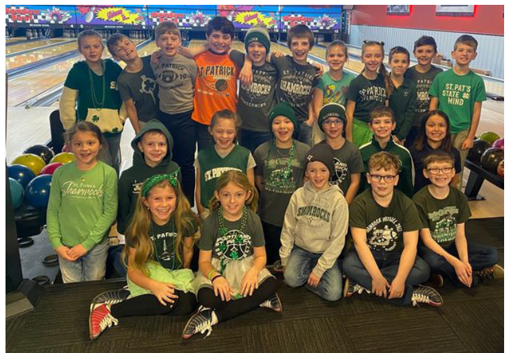
Students enjoyed bowling, movies, and various activities to wrap up Catholic Schools Week. Thanks to all who choose Catholic education for your child!