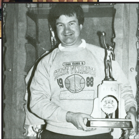
And, flashback a little further to 1988 when his team made their first appearance at a state final game and brought home a runner-up trophy.