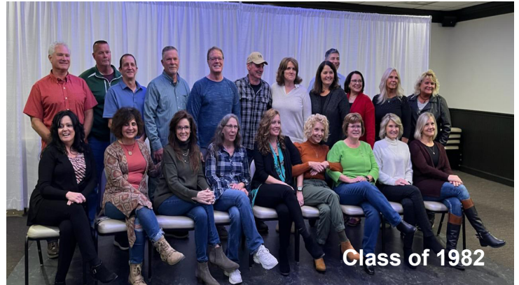
Class of 1982

The Class of 82 , 40-year reunion was held at the Wagon Wheel, on Saturday, November 12, 2022.