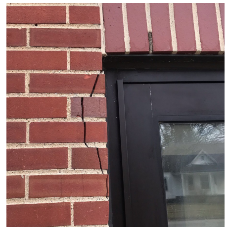
Cracks in the bricks and missing mortar in the joints need immediate attention.