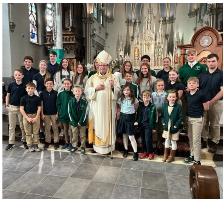
During Catholic Schools Week, two children from each grade were able to attend Mass at the Cathedral of St. Andrew in Grand Rapids where Bishop Walkowiak was presiding! The rest of the school was able to participate by watching virtually.