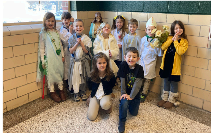
Catholic Schools Week is always great fun. One of the daily themes was Dress Like a Saint!