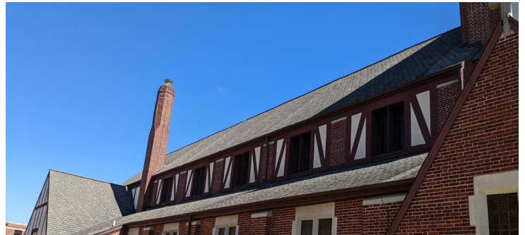
The church roof will be replaced this summer to repair damage from two storms. The cost will be paid by our insurance company.

Last summer, an inspection of the church roof revealed damage to the shingles. The damage came from the 2015 tornado and also the hail storm which hit parts of Portland last May. The cost will be over $200,000, but fortunately, our property damage insurance will cover the anticipated costs. Special high lift equipment is needed to reach the