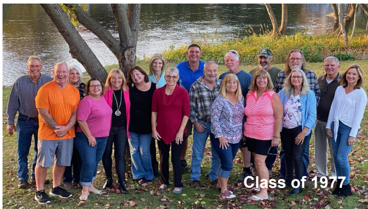
Class of 1977

The Class of 1977 had an awesome 45-year class reunion on Saturday, October 22, at Fabiano's Point. There were 18 classmates in attendance as well as many spouses/significant others. In the afternoon they enjoyed picture perfect weather while golfing at the Portland Country Club.