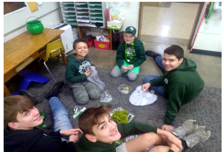
Big Rocks and Little Rocks worked together on their fairy houses as part of our "Reading Enchants Us" theme.