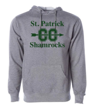
Cross Country Apparel

Click on the links below to see what is available for each sport. Choose from t-shirts, long sleeved shirts, or sweatshirts.