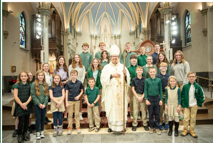
A delegation of St. Patrick students attended the Catholic Schools Week Mass at St. Andrew Cathedral on Tuesday.

No School - Professional Development Day Daycare Open