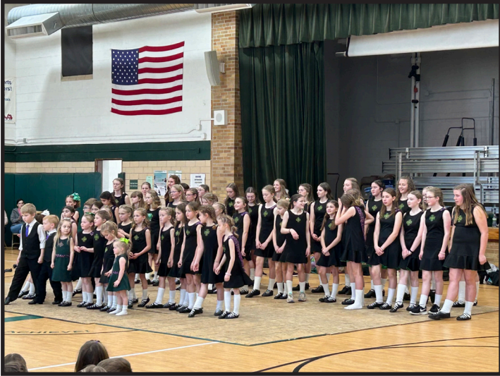
Many St. Patrick School students are members of the Hubbardston Irish Dance Troupe, which performed at our St. Patrick's Day Celebration.