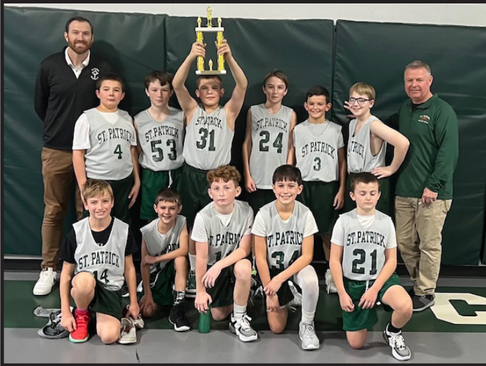
The 5th-grade boys basketball team with their trophy after finishing 2nd in the CYAC tournament.