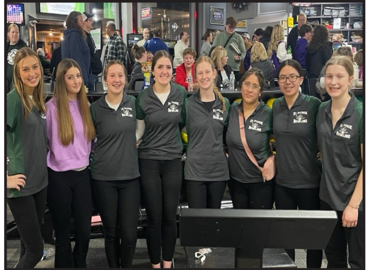
The high school girls' bowling team, after advancing to States.