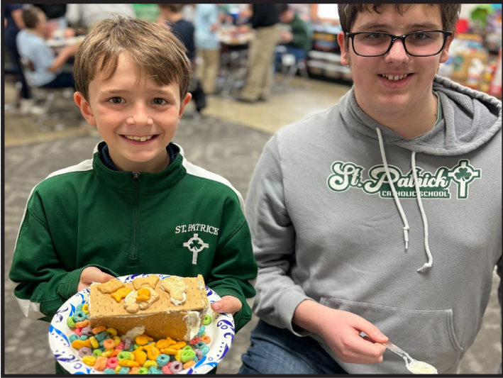
Little Rocks worked with their Big Rocks to build Noah's Arks from tasty building materials.