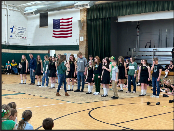
Some of our students and staff learned a dance with the Hubbardston Irish Dance Troupe.