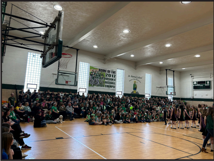
All our students gathered in the gym for our St. Patrick's Day celebration.