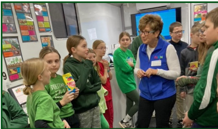
Students participating in the Farm Bureau traveling lab that was at St. Patrick School during Catholic Schools Week.