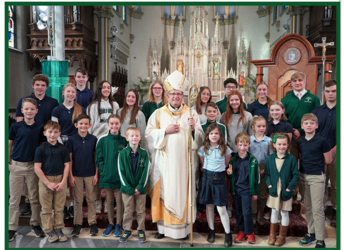
Student representatives from grades 1-12 attended Mass at St. Andrew Cathedral during Catholic Schools Week.