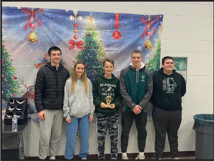
The High School Quiz Bowl team recently finished their season with a league tournament hosted by Laingsburg, in which they finished in 4th place.