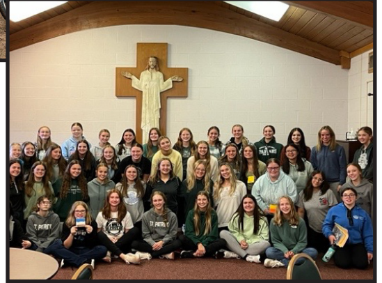
Our high school students recently went on a retreat. The boys participated in a bike ride with various stops along the way. The girls visited the Dewitt Retreat Center.