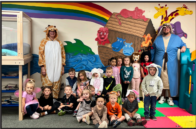
Our preschool students had fun dressing up for their Noah's Ark Unit.

We also would like to inform you that we will no longer be placing remittance envelopes in our Christmas Cards. We are mailing all our benefactors and supporters a card to thank you for your continued support of St. Patrick School, and we want to wish everyone a Merry Christmas and a Happy New Year!