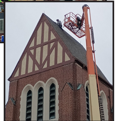
The church roof being replaced after storm damage.