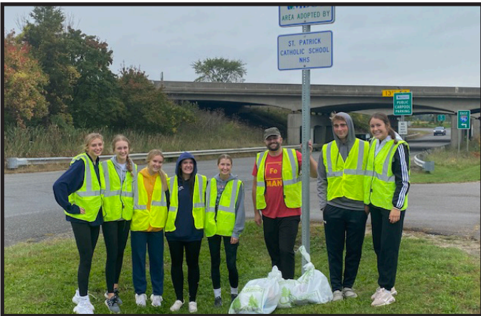
Some members of our National Honor Society while working on their Adopt a Highway Project.