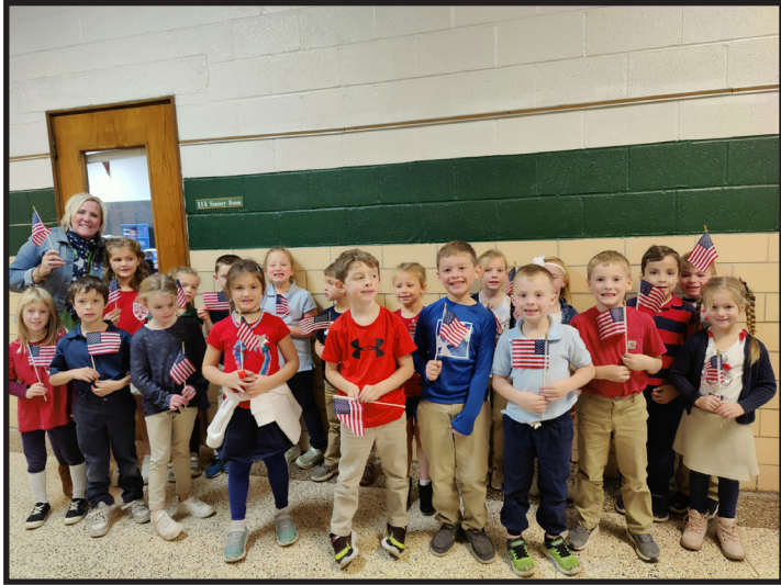
In celebration of Veterans Day, St. Patrick Catholic School honored our Veterans. Thank you to all who attended our Veterans Day observance, which featured our high school and middle school choirs singing the national anthem and treats for our Veterans and their families.