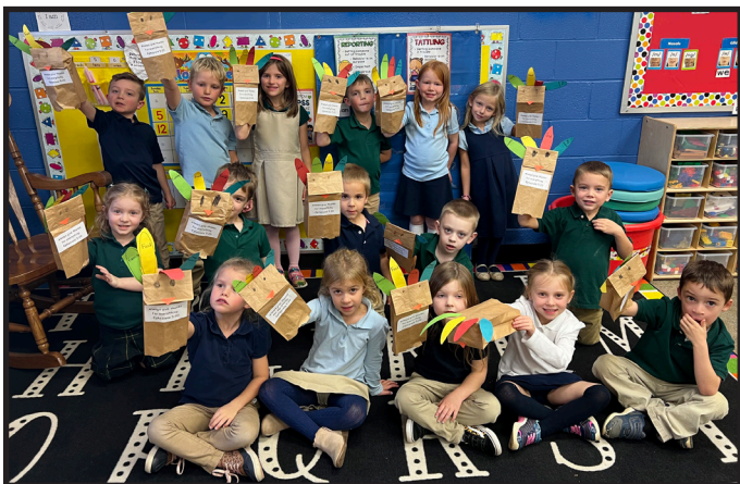
Kindergarden students had a blast making turkey puppets to show what they are thankful for.