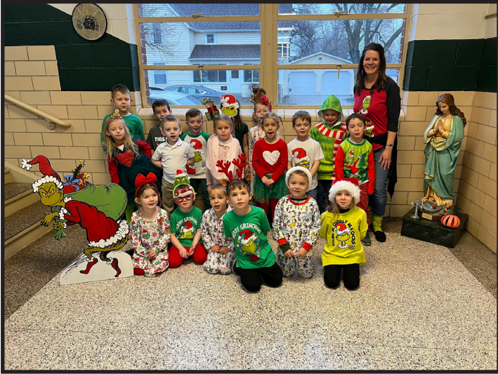
Our multi-age Kindergarteners had fun dressing up to celebrate Grinch Day!