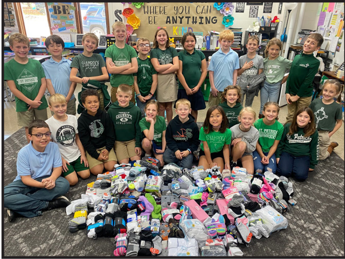
St. Patrick School students with the 1,624 socks collected during Socktober to be donated. We partnered with the Michigan State Police Training Division on this corporal work of mercy.