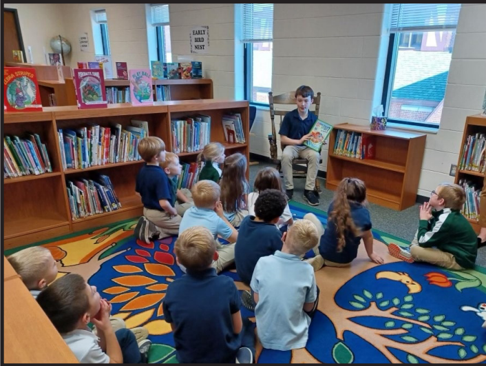
The 5th-grade students show outstanding leadership in the library by taking turns reading stories to the younger grades.