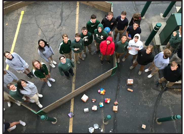
The Freshman physical science class recently tested their engineering skills in the annual egg-drop competition.