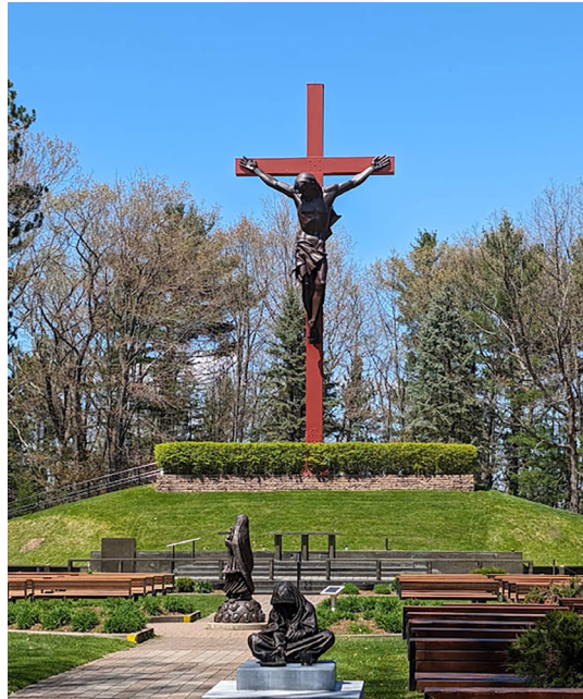
The Cross in the Woods in Indian River

No matter where your family goes for vacations, look around and see what Catholic sites are nearby. I promise that you will not be disappointed!