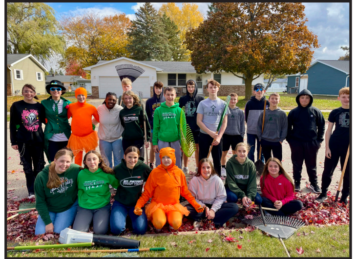
St. Patrick School 8th-grade students after serving the community during Pay It Forward Day.