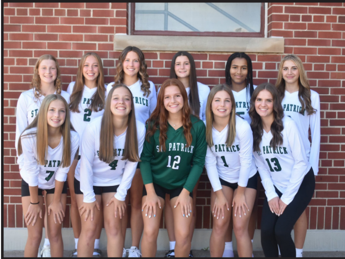
The St. Patrick School Varsity Volleyball Team. Coaches are proud of this young team! Despite challenges, these girls consistently showed they could compete with anyone.