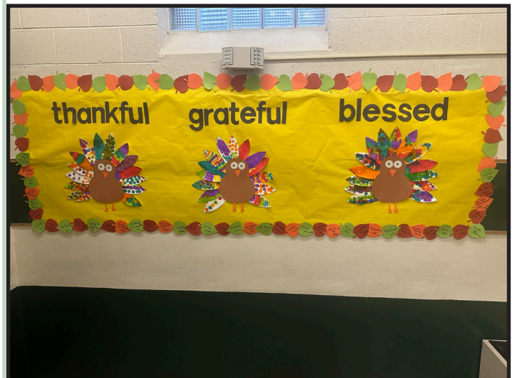
St. Patrick's Preschool students decorated turkey feathers this month and shared what they are thankful for.

"Each of you should use whatever gift you have received to serve others, as faithful stewards of God's grace in its various forms."