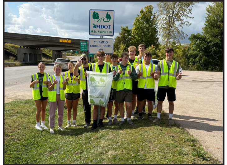
Our National Honor Society students helped beautify the community by picking up trash at the park-and-ride as part of the Adopt-a-Highway program.