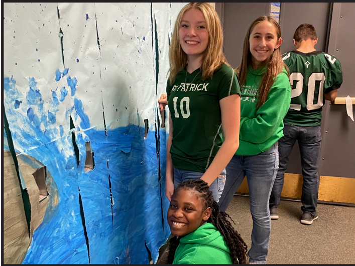
Students have fun decorating their hallway for our annual homecoming spirit week.